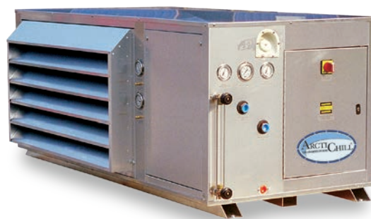
Compact water-cooled self contained or air cooled chillers with full redundancy can solve many critical-duty needs for imaging, blood cooling and Surgical Suites.