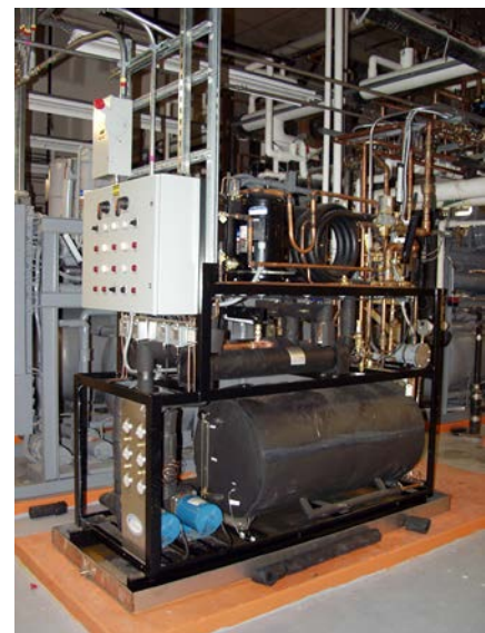
Custom open-frame system is one of several delivering low-temperature water to Cardiac Surgical Suite.