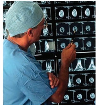
The ability to maintain low ambient temperatures and humidity in Surgical Suites is critical more many procedures.